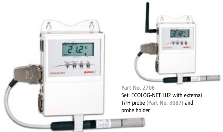
Part No. 2706 Set: ECOLOG-NET LH2 with external T/RH probe (Part No. 3087) and probe holder Part No. 2705 LH2 Part No. 2707 WH2 (wireless LAN)