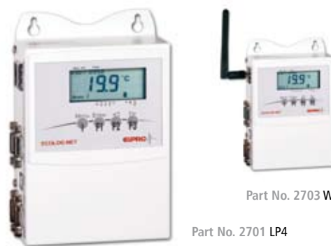
Part No. 2701 LP4 Part No. 2703 WP4 (wireless LAN)