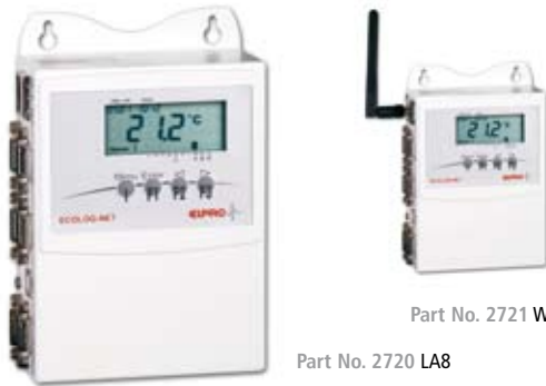
Part No. 2720 LA8 Part No. 2721 WA8 (wireless LAN)